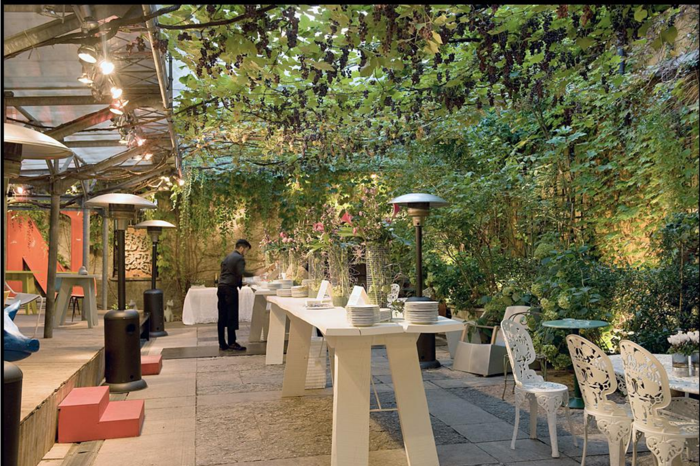
Dinner was served in the courtyard, now covered by vines heavy with bunches of grapes.