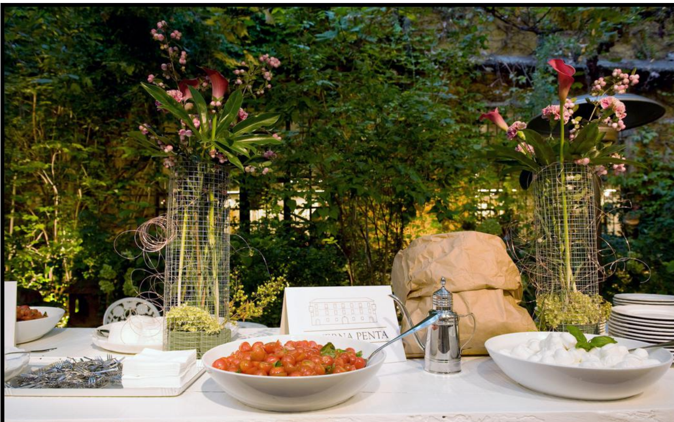
Three kinds of buffalo-milk mozzarella, a Naples specialty, were served.