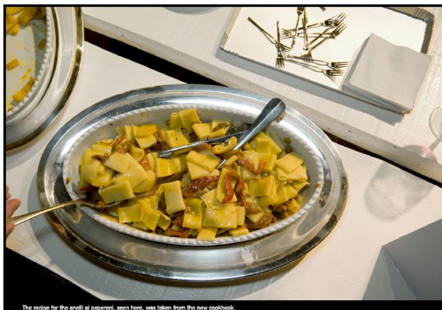
The recipe for the anelli ai peperoni, seen here, was taken from the new cookbook.