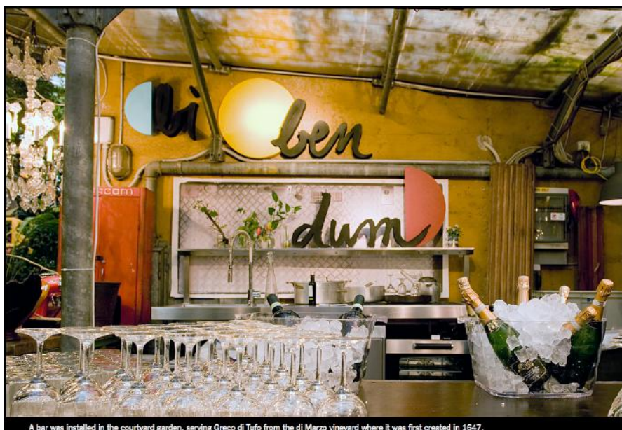
A bar was installed in the courtyard garden, serving Greco di Tufo from the di Marzo vineyard where it was first created in 1647.