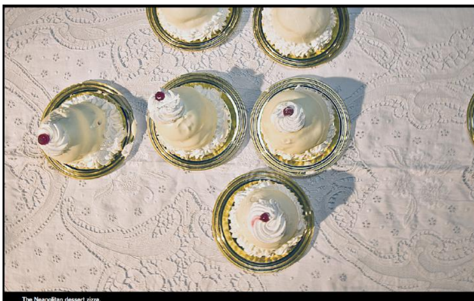
The Neapolitan dessert zizza.